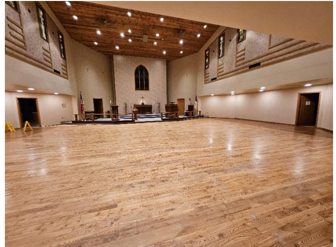
After Pews Removed