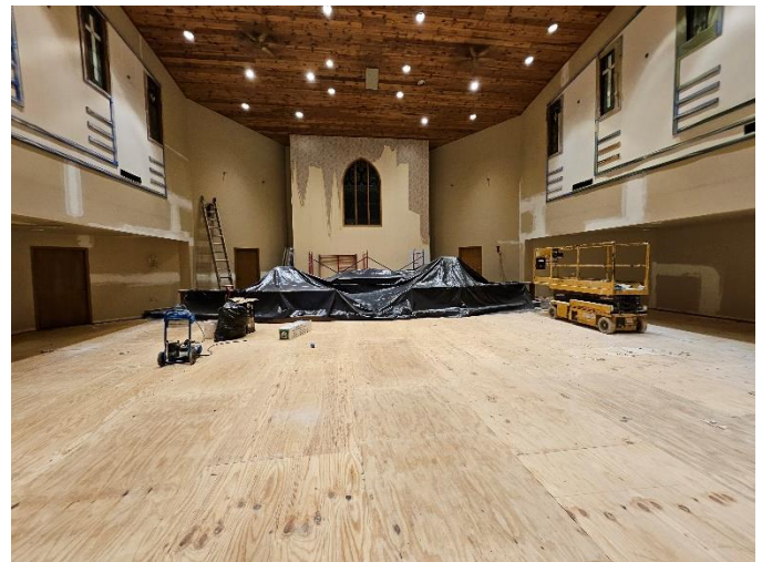
Floor gone, new underlayment, wallpaper removal, mud & taping