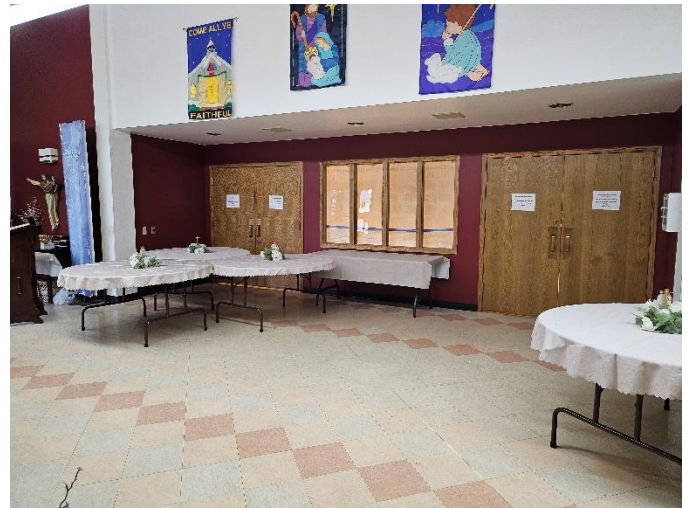
This is where the soup & sandwich suppers are for now.