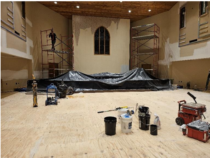
Scaffold up, more taping.